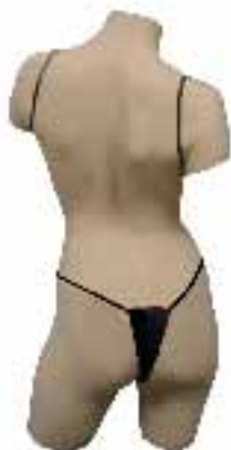
Backless Bra & Thong

Made of soft spunbonded material DUKAL Reflections™ Spa Undergarments combine comfort with just the right amount of coverage. A variety of styles and sizes are available to accommodate any treatment. Each garment is individually wrapped for hygienic purposes.