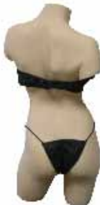
Bandeau Bra & Bikini Panty